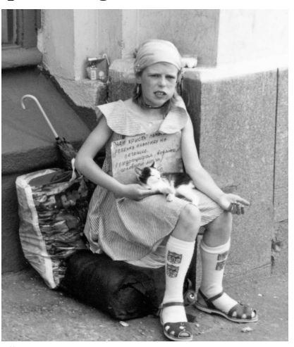
"I'm orphaned and homeless . . ." Russia takes its place in the free world

2nd place for suicide (Lithuania is in first place): More than 50,000 suicides per year are reported.