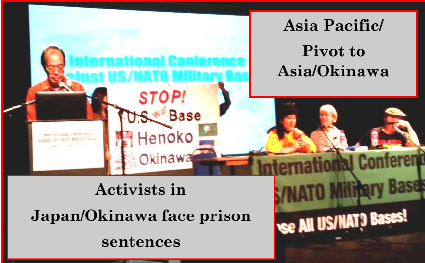
Asia Pacific/ Pivot to Asia/Okinawa

These photographs & report give a glimpse into the work of anti-war activist attending the conference on the 16th 18th November in Dublin.