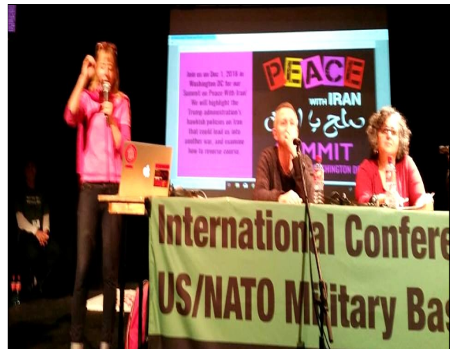
CODEPINK: Women for Peace (USA) Medea Benjamin speaking on the Middle East: US/NATO plan