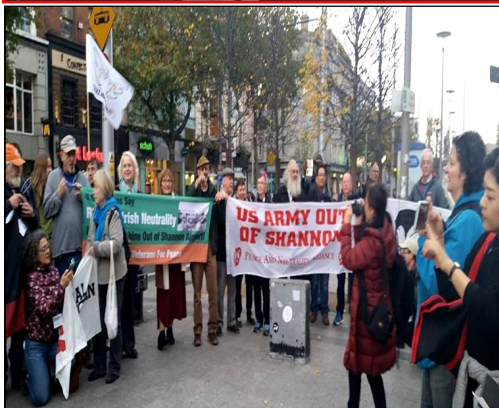
Conference Delegates Rally outside the GPO Dublin