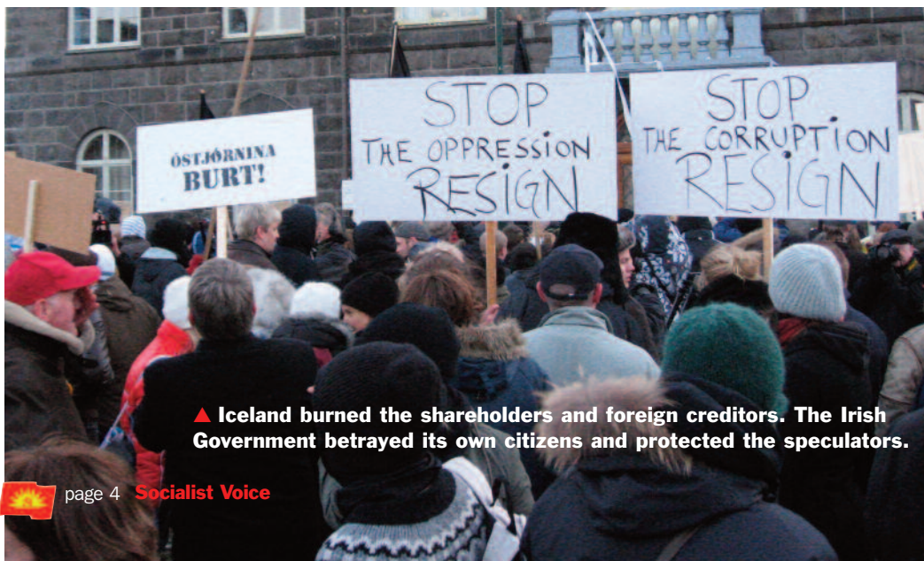
▲ Iceland burned the shareholders and foreign creditors. The Irish Government betrayed its own citizens and protected the speculators.

There will be more of this misdirection in the months ahead.